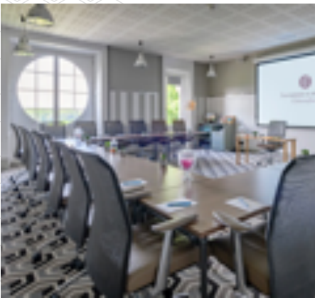
Figure 11. Preferred Meeting Room Types

When presented with several options of room types and asked to rank their likelihood of using the room type (on a scale of 1=not likely to 10=highly likely), as was the case in the global research, meeting planners in Latin America were most likely to use flat-floored meeting rooms offering flexible layouts, or rooms offering a homelike lounge style informal seating. Auditoriums and rooms with no natural daylight are not favoured by planners.